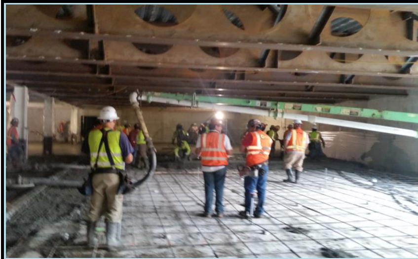
North Basement Slab on Grade Concrete Pour