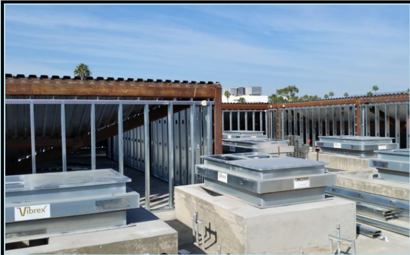
Area B North Mansard Roof Framing