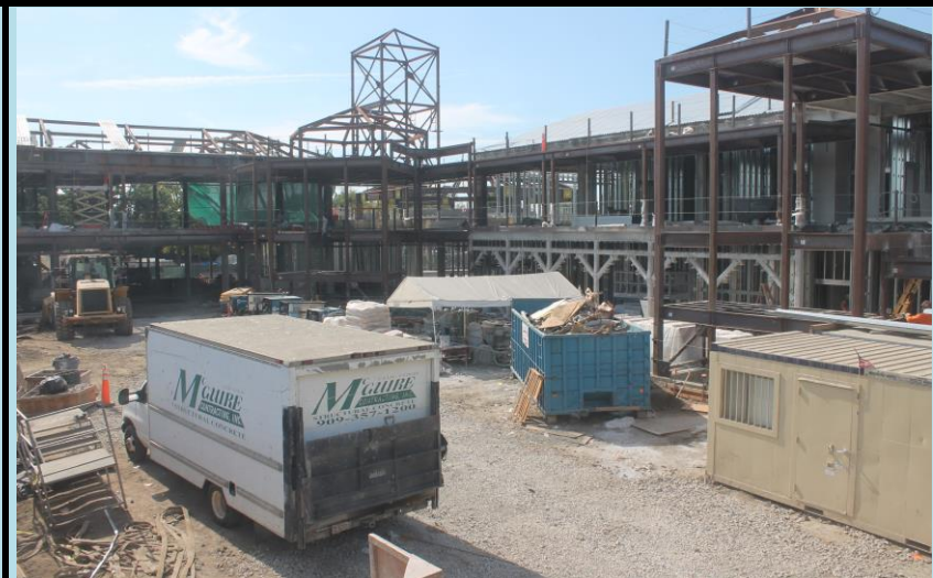
Image from workzone time lapse camera