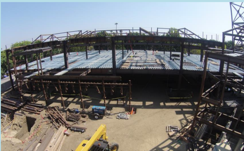
Steel Erection at "Area A"