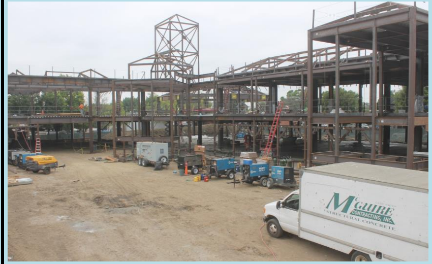
Image from workzone time lapse camera