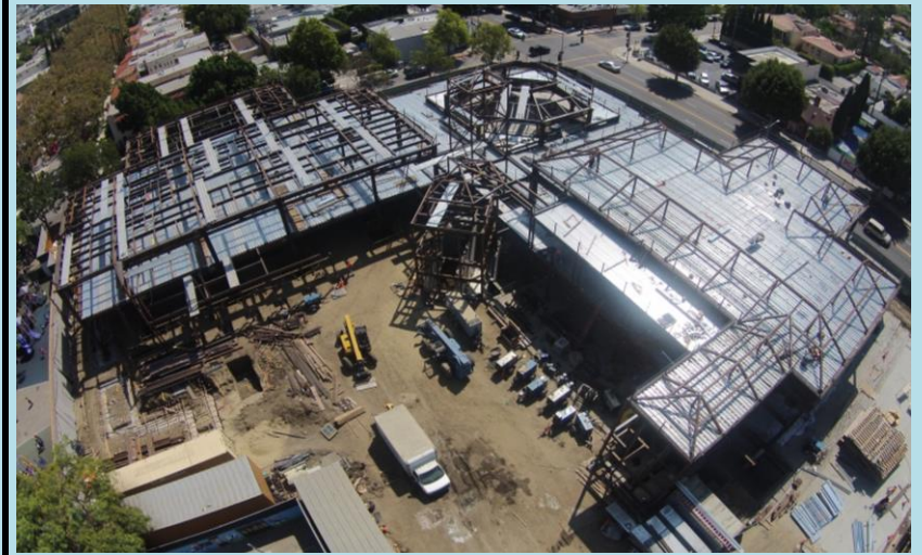
Aerial View of Building B.