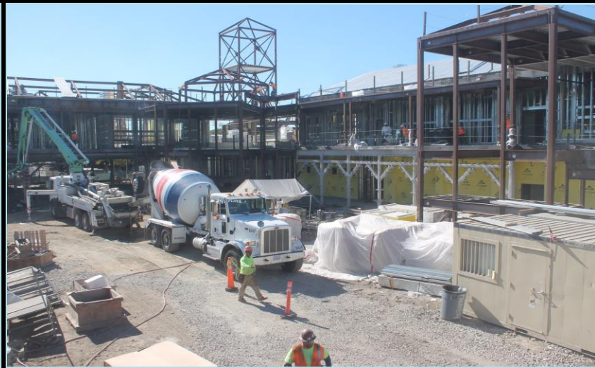
Image From Workzone Time Lapse Camera