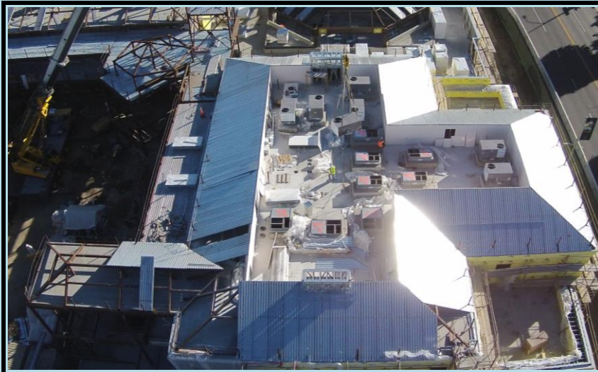
Setting AC RTU's at Area B