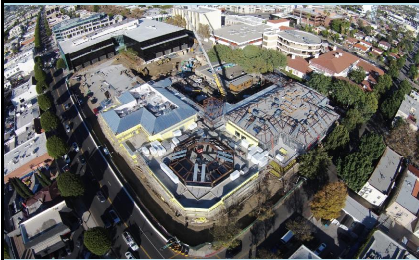
HMS Building B Aerial