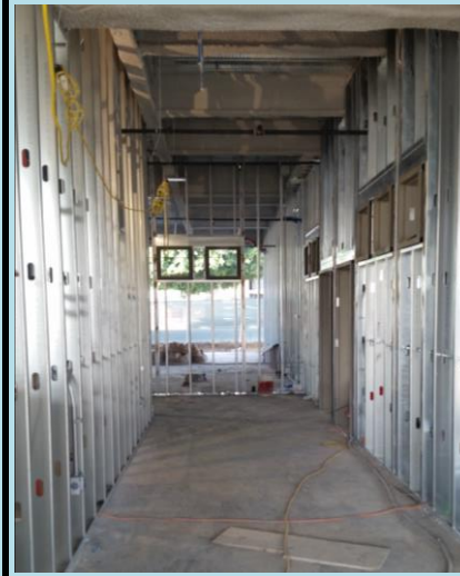
Left - Corridor to Science Labs