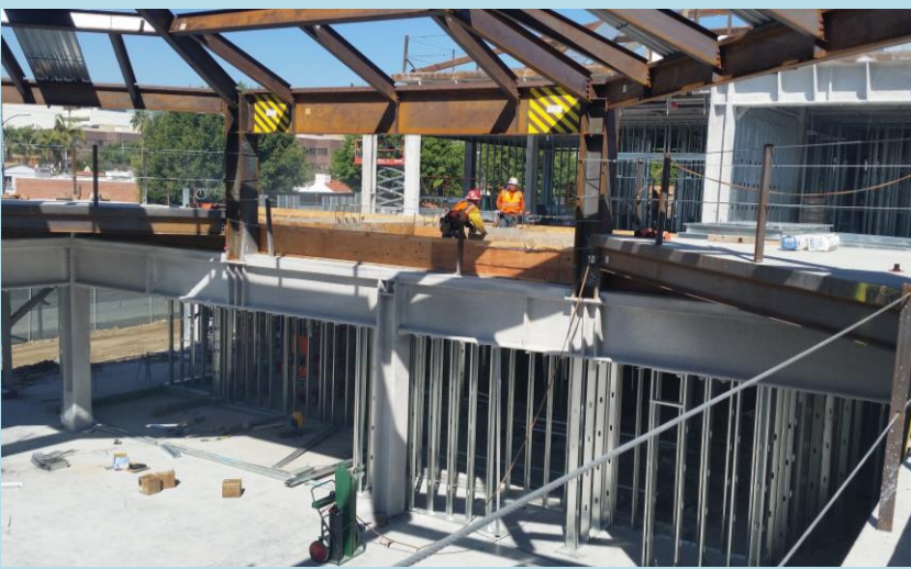
Framing at MPR.