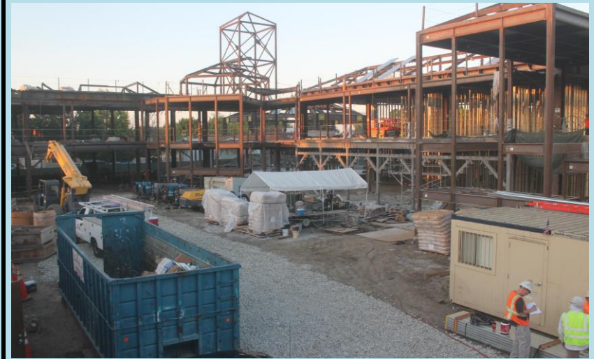
Image from workzone time lapse camera