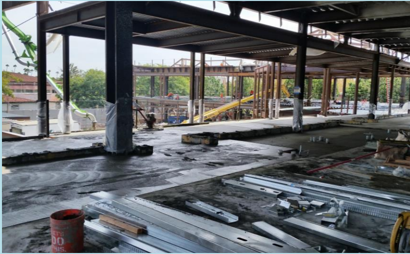
Second floor Deck pour at B-North.